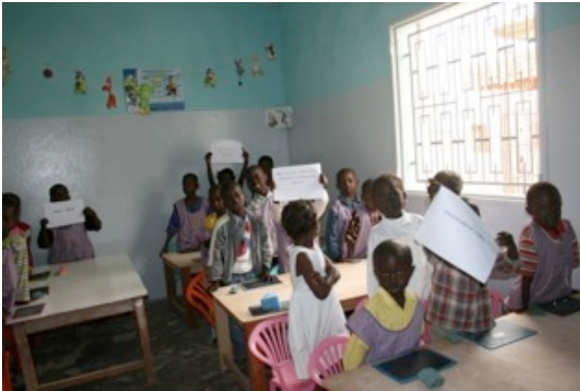
Tables and chairs