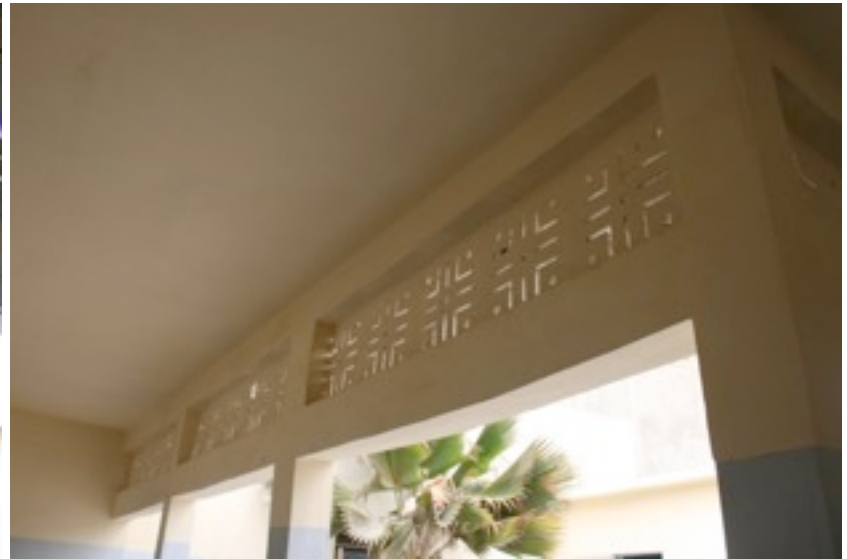
After the reparation