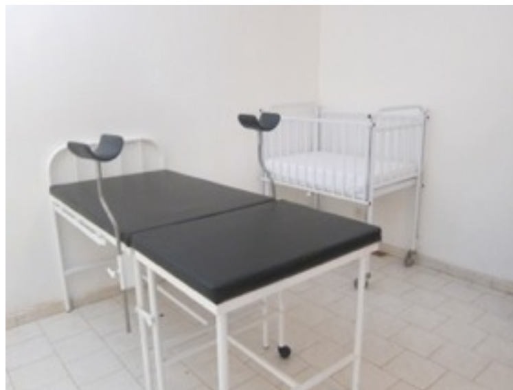
New delivery room