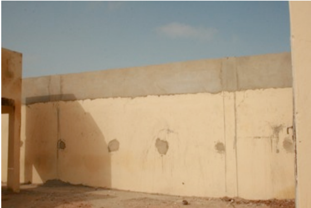
New wall, waiting to be painted

Funding : 380 000 – building material to elevate the wall.