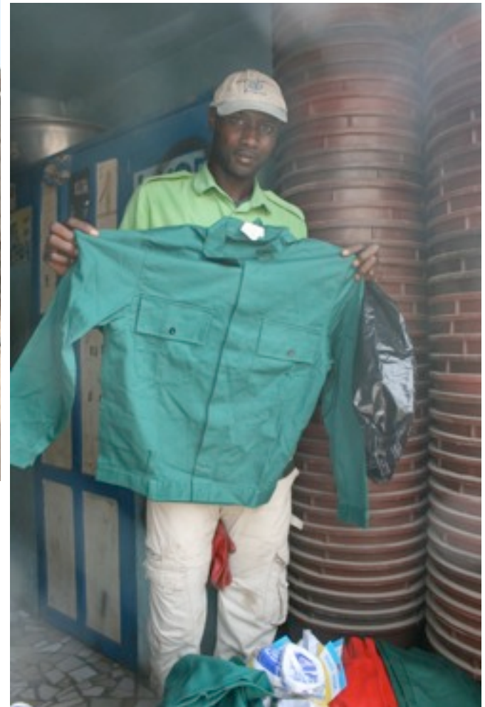
Uniforms and bins