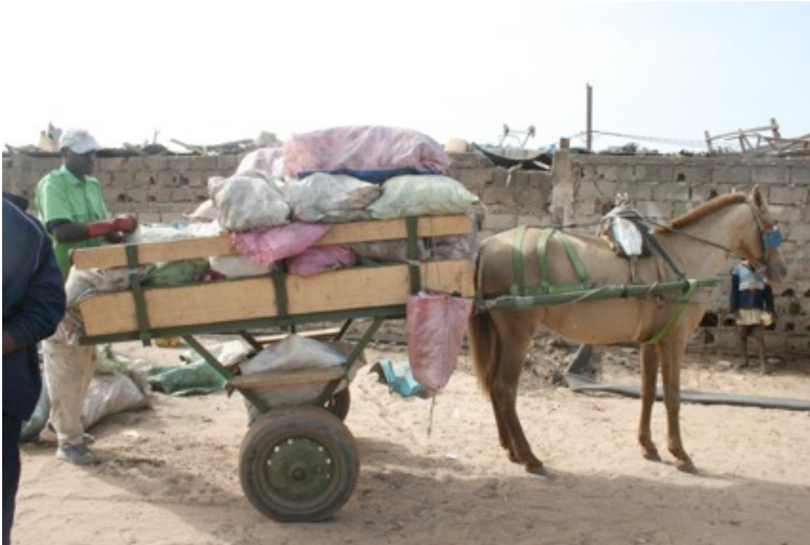
Horse and wagon