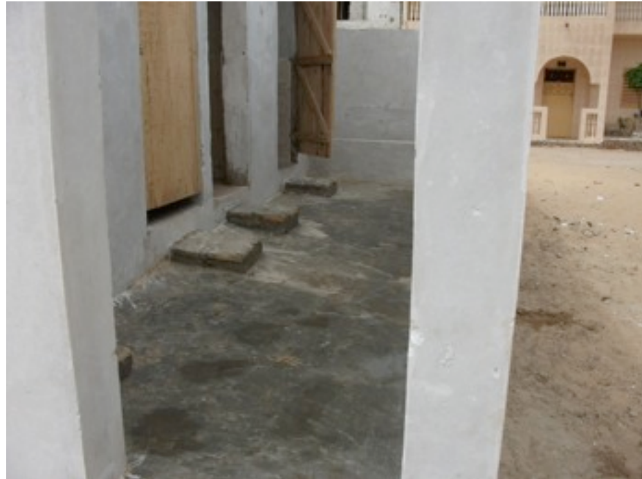
new restroom girls