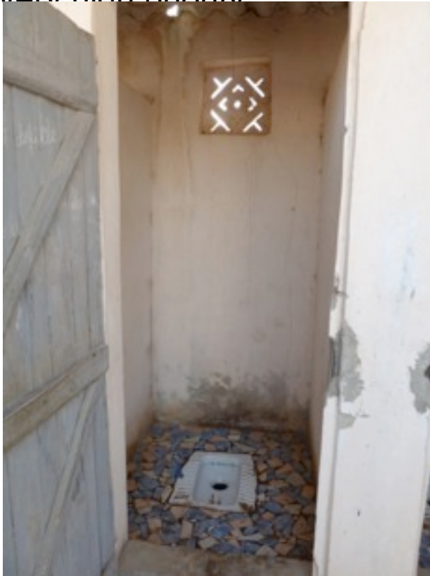
Ancient restroom girls without water

This school is a new application. They have only four toilets in very bad conditions for more 450 students. They want to renovate the old toilets and build six more, and washroom to wash hands. This project is considered as a very high priority.