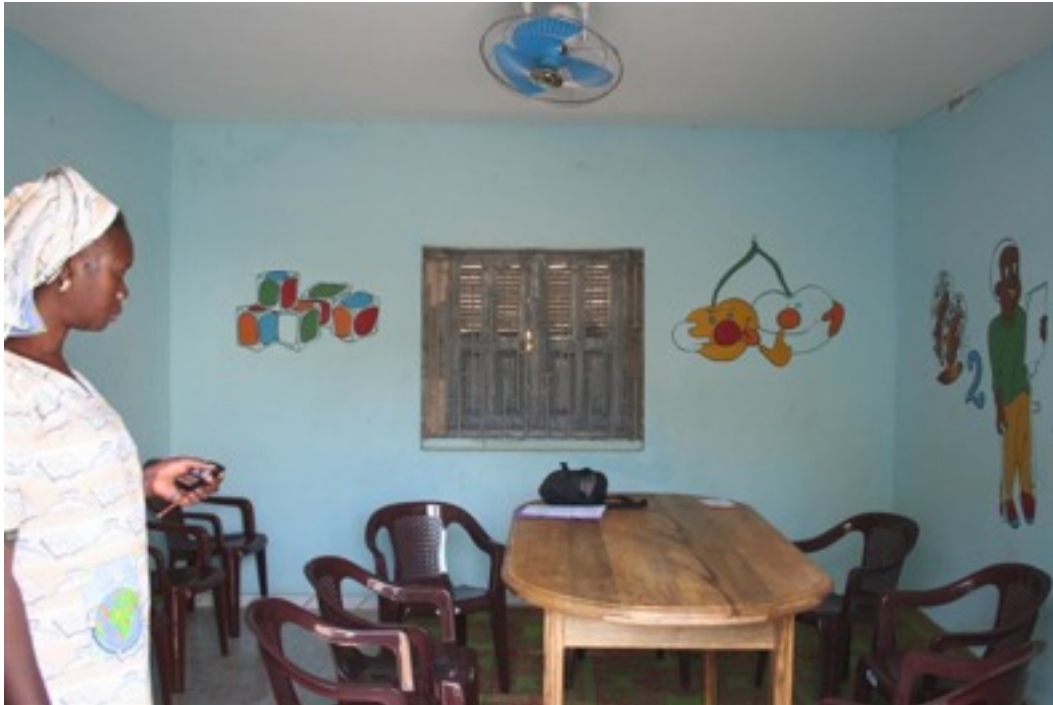
Table, chairs and fans

Funding : 450 000 – tables / chairs / Ceiling fans / Refrigerator